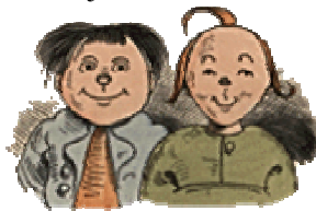
Max und Moritz

The first comic strip, which consisted of a sequence of drawings that told a story, dates back to the 1865 premiere of Max and Moritz, a moralistic German comic strip about two trouble-making boys written by Wilhelm Busch. By the late 1800s, American newspaper companies were discovering that comic strips dramatically increased sales. Press magnate Joseph Pulitzer hired German immigrant Rudolph Dirks to pen a light-hearted take-off of Max and Moritz, called The Katzenjammer Kids, which ran in the New York World. William Randolph Hearst responded by hiring Richard Outcault to create The Yellow Kid for his many papers. It was a tale about a child growing up in the tenements. As competition increased, comic strips began to appear daily and feature color.